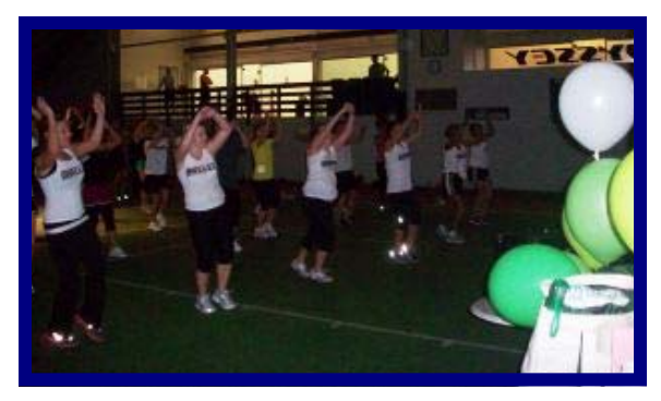
60 people participated in the Body Combat class at Odyssey Fitness to support LFG and truly worked for a cause! Many thanks to all!