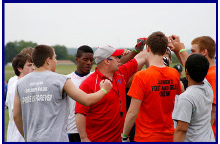
Teamwork in Pennsylvania.