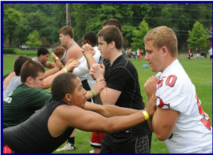
Campers in action in Ohio.

384 registered campers 83 coaches representing 34 institutions